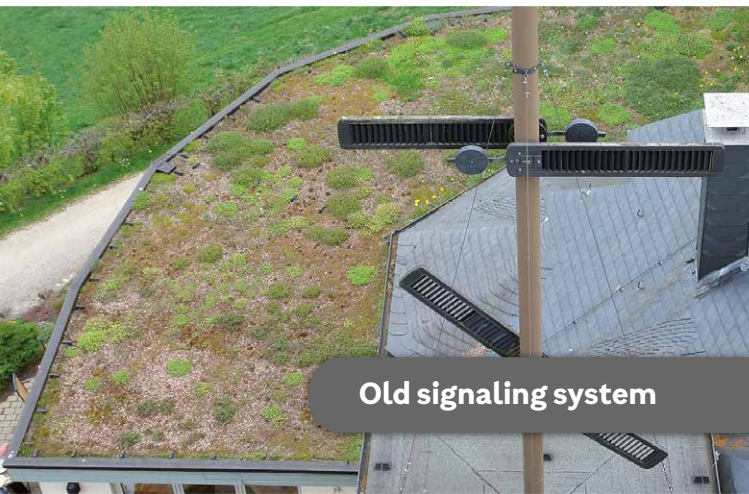
Old signaling system

The tower's opening hours coincide with those of the Panorama Restaurant.